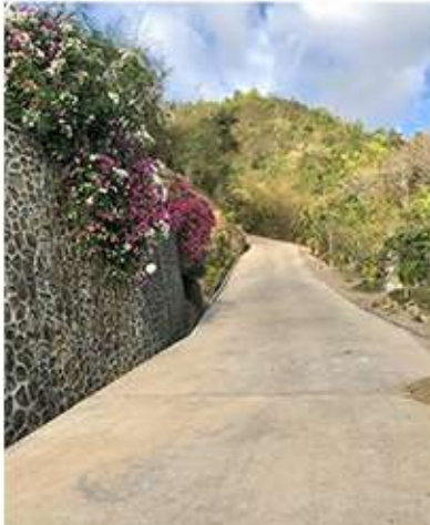
FULLY CONCRATE ROAD