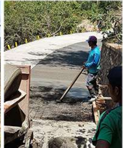
CONCRETING OF KHD ROAD HAS BEGUN